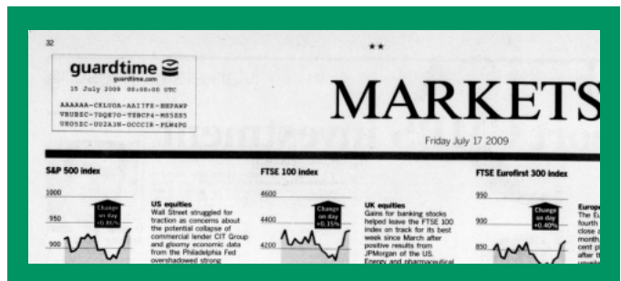
FIGURE 3: GUARDTIME MERKLE ROOT PUBLISHED IN NEWSPAPER (TOP LEFT)

Of course, the requirements for an Internet currency without a central authority are more stringent. A distributed ledger will inevitably have forks, which means that some nodes will think block A is the latest block, while